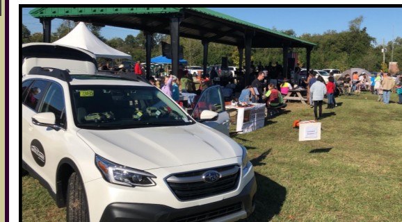
Gerald Jones Subaru displaying a brand new car at CanalFEST

Thanks to all the community supporters, sponsors and raffle donors! Those contributions and proceeds go directly into the Augusta Canal National Heritage Area, Inc. 501(c)3 to benefit projects in the park. CanalFEST also served as the Membership Fall Event. They were given VIP tickets to the festival and enjoyed a private tent, free drinks, food, and admission to the boat tours! Thanks to Finch & Fifth for sponsoring the VIP tent for the second year! UPDATE: The Augusta Canal staff and board have decided to move CanalFEST to the spring. Therefore, we will pass on 2020 and return SPRING 2021!