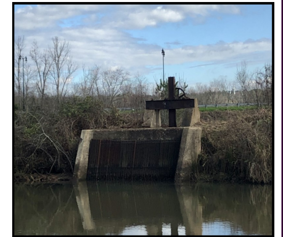
What is left of the Russell and Simmons mill. This is located just north of Sibley Mill, across the canal